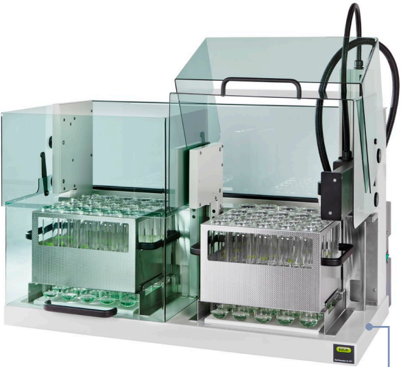
KjelSampler K-377 48 sample positions in two rack trays and eight express positions.