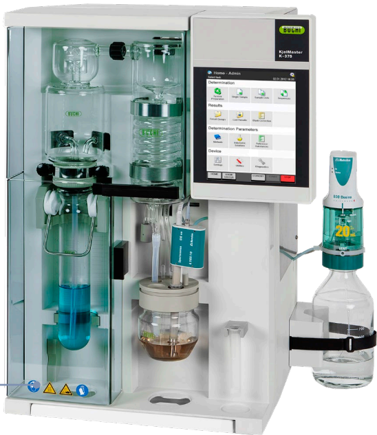
KjelMaster K-375 With glass splash protector and colorimetric sensor.