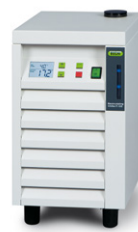
Recirculating Chiller F-100 / F-105 The easy way of cooling