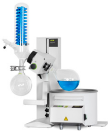
Rotavapor® R-100 Economical evaporation