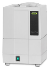
Vacuum Pump V-100 Economical vacuum source