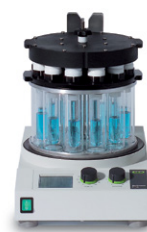
Multivapor™ P-6 / P-12 Efficient evaporation for multiple samples