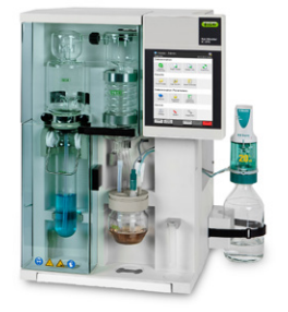
KjelMaster K-375 Steam distillation and titration