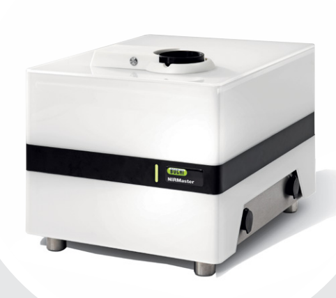
Ease of use At-line measurement with hygienic design